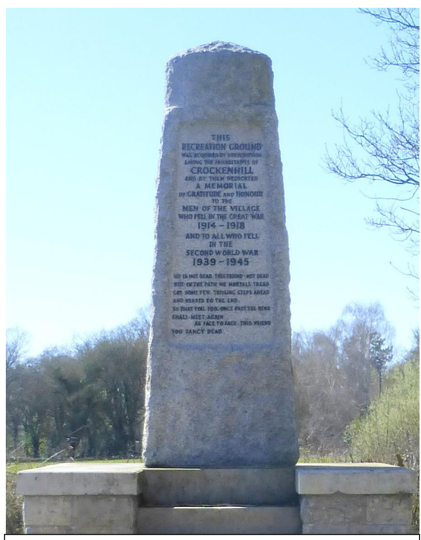
Original inscription as on right, but photo with Second World War added, March 2014

This Recreation Ground was acquired by Subscription among the inhabitants of Crockenhill and by them dedicated a memorial of gratitude and honour to the men of the village who fell in the Great War 1914-1918 He is not dead this friend not dead but in the path we mortals tread got some few trifling steps ahead and nearer to the end so that you too once past the bend shall meet again as face to face this friend you fancy dead.