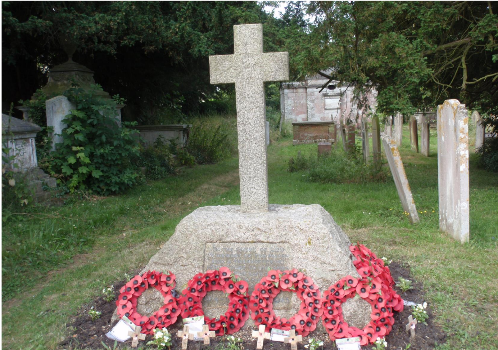
Farningham war memorial, inside south gate to Church, July 2013