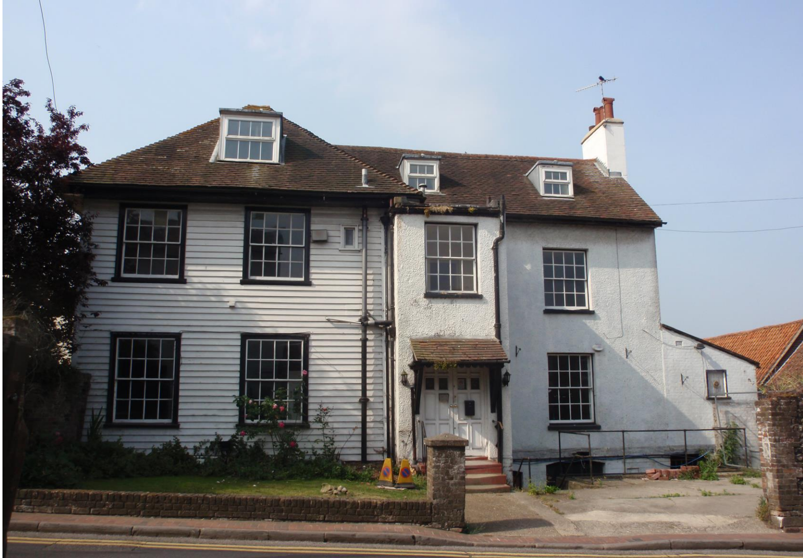
The Croft House, once Farningham Men's Club & Institute, July 2013