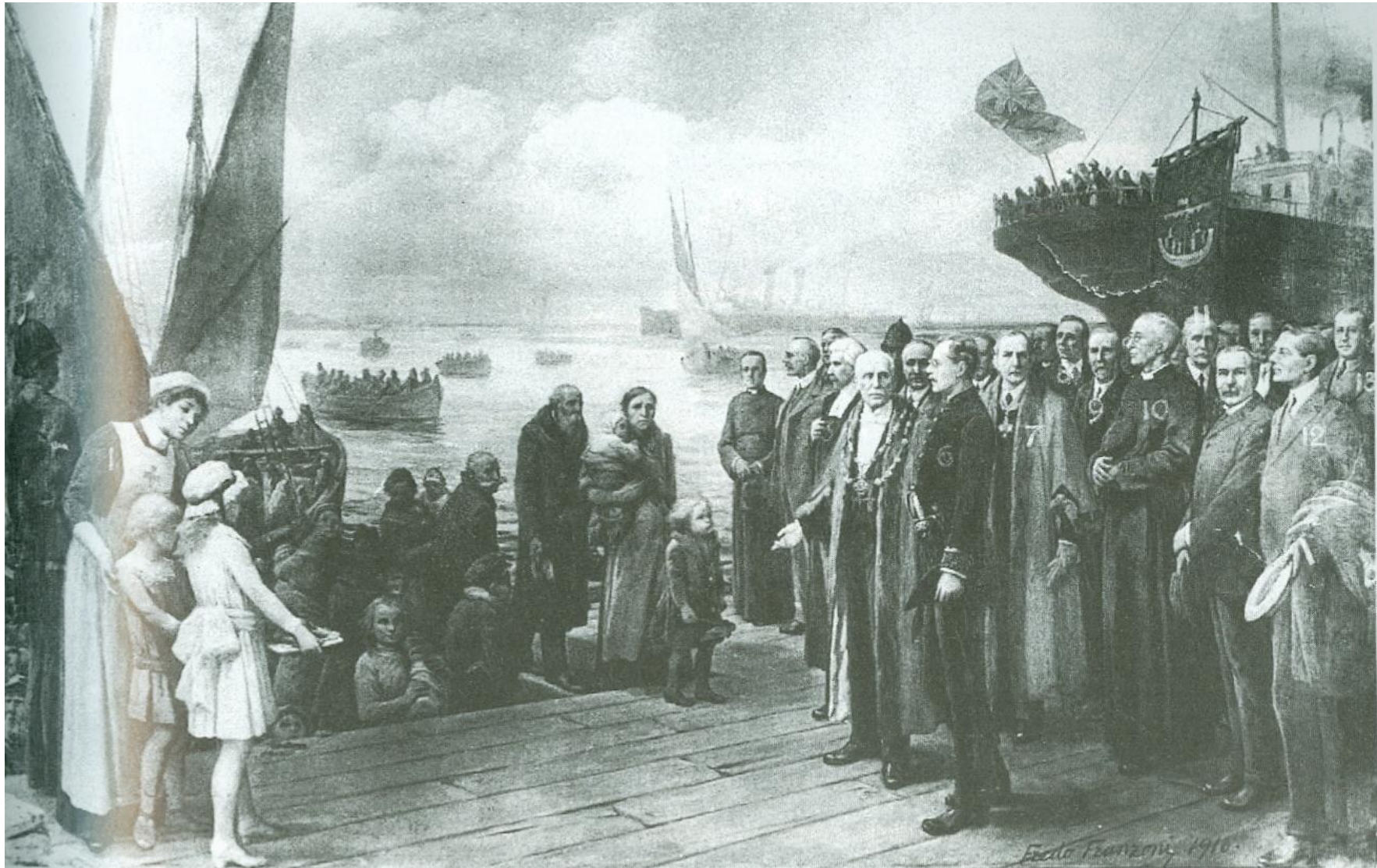
A civic welcome in Dover for these boat loads of refugees from Belgium.