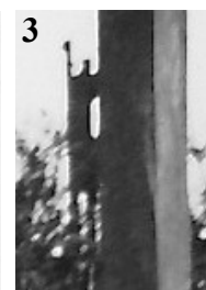
Siren on the fire station (not attached to swing post as it appears, but some distance beyond).