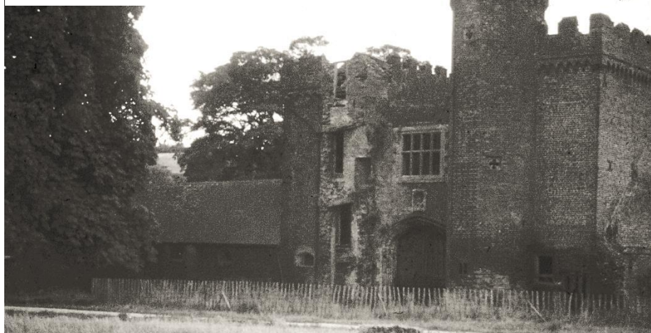
Damage to Lullingstone Gatehouse from V1 of 11/11/1945, here in 1952 before repairs.