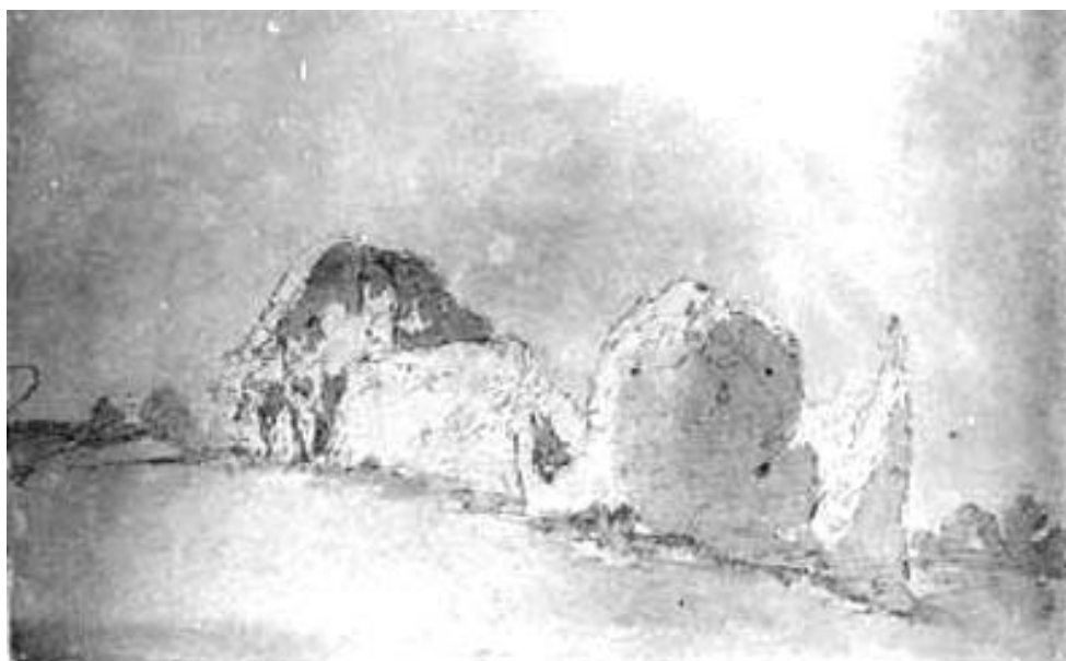
Ruins of Saxon Church at Maplescombe, 1807, watercolour by H. Petrie. (KAS website)

Sadly, this is on the 'at risk' register of Listed Buildings compiled by Historic England. This Grade II scheduled monument is 'generally unsatisfactory with major localised problems'. It is 'declining' being vulnerable to scrub and tree growth. It is in private ownership.