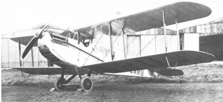
De Havilland 16 G-EARU, which crashed near Swanley on 10 June 1920.