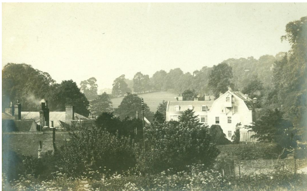
Farningham Mill from an unusual viewpoint.

Like his ancestors, conspicuous for his loyalty. On the flight of James II (1668), he accompanied that unfortunate monarch into exile, and advanced several sums of money to relieve his royal master's necessities. Ob. 1703 being killed by a fall from his horse, while hunting in the forest of St. Germain, near which place he was buried, and an elegy inscribed to his memory by his friend Sir Roger L'Estrange.