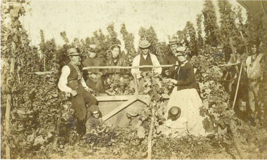
above: Victorian on thick card.