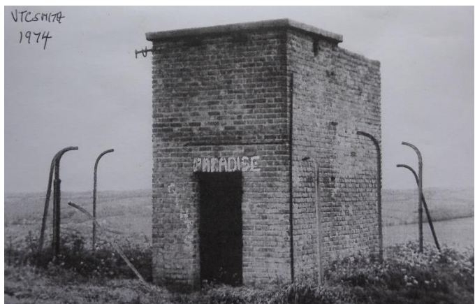
below: 2nd World War Observation Post seen by Victor Smith in 1974.