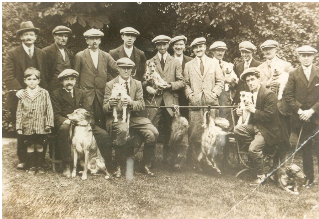
Members of Eynsford Rat and Sparrow Club after a group event to kill badgers - two unfortunate victims are hanging from the pole. Men pose with a selection of dogs to send into the setts or to pursue the creatures.

FELHS no. 27 Brief Histories of the Associations etc. of Eynsford and Farningham p.51