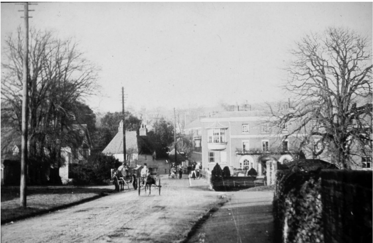
Looking north up (towards A20) Farningham High Street, with The Lion - probably 1890s horse-drawn transport, but after telegraph installation.