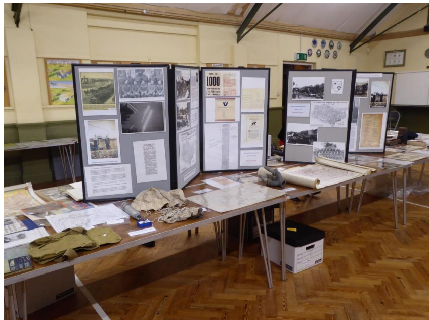
Display of 2nd World War items from FELHS collection.