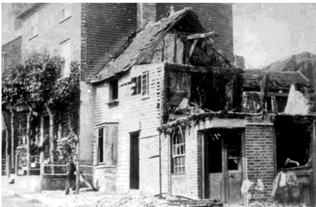
Fire damage to The Chequers , Farningham - so far undated.

Farningham is described as having changed from a lively important stage-post to a sedate country village. Is that still a valid description??!