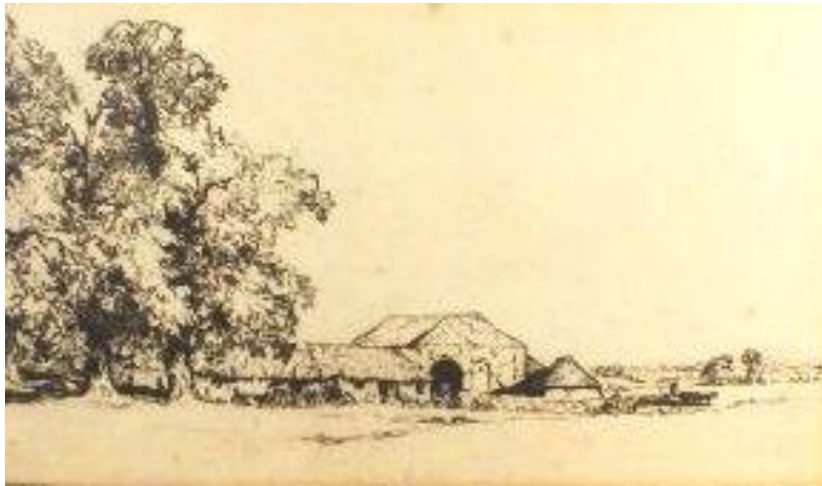
New Barn Farm 1919